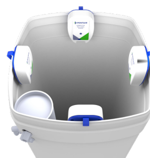
SQUARE BRINE TANK

Note: Visuals above indicate potential positions for the Connected Salt Level Sensor within the brine tank. Only one sensor is needed per brine tank application.