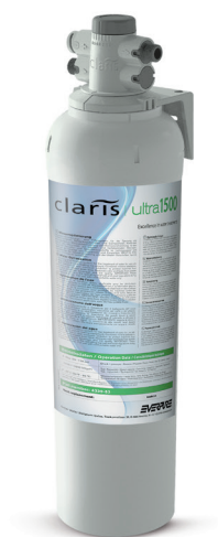
Head sold separately.

Claris Ultra 1500-XL Filter Cartridge: EV4339-83