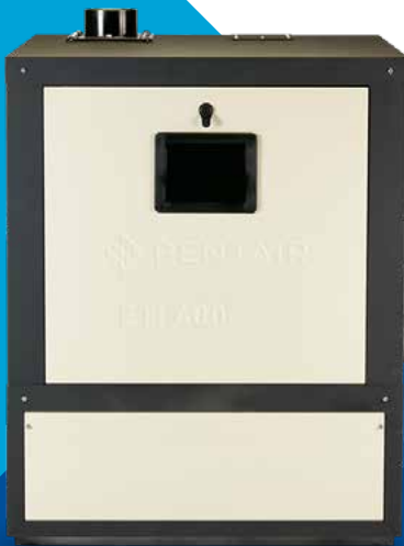
ETi 400 High-Efficiency Heater